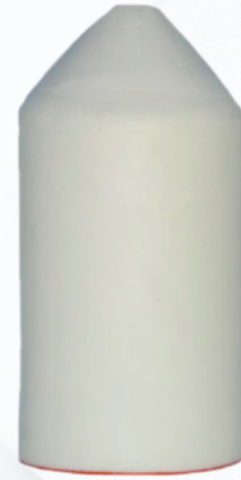
HB Heavy Density Bare Foam