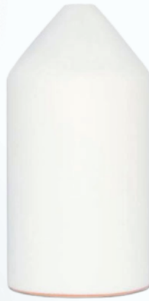
MB Medium Density Bare Foam