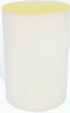
LB Light Density Bare Swab